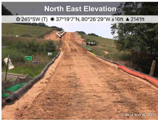
Figure 3: Designated crossing S-0014 & W-CD12