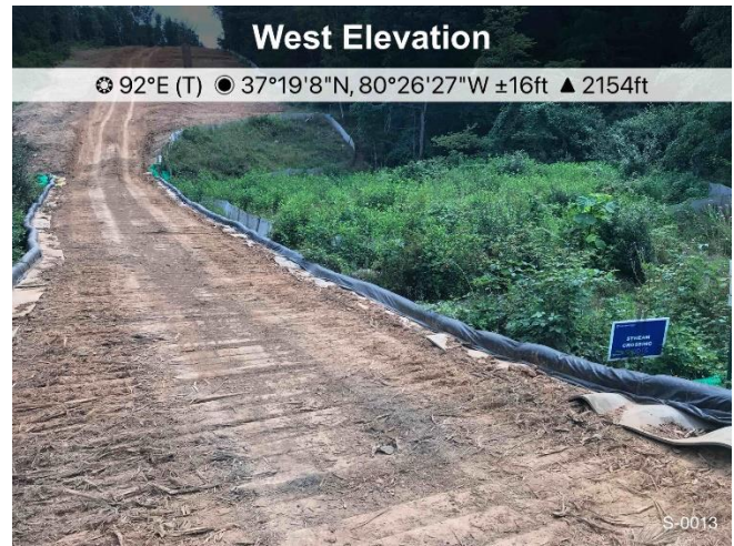
Figure 2: Designated crossing S-0013