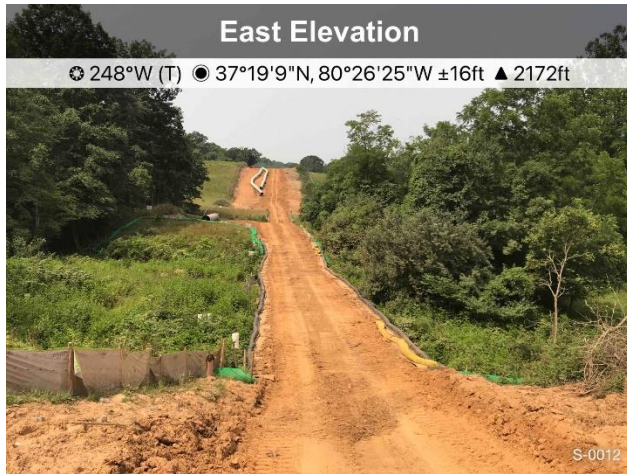
Figure 1: Designated crossing S-0012