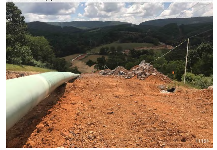
<u>Figure 2</u>: STA 11138+00 – Controls in place and functioning properly.

BRG: 103°E (T) LAT: 37.312516 LON: -80.518535 ±16ft ALT: 2029ft