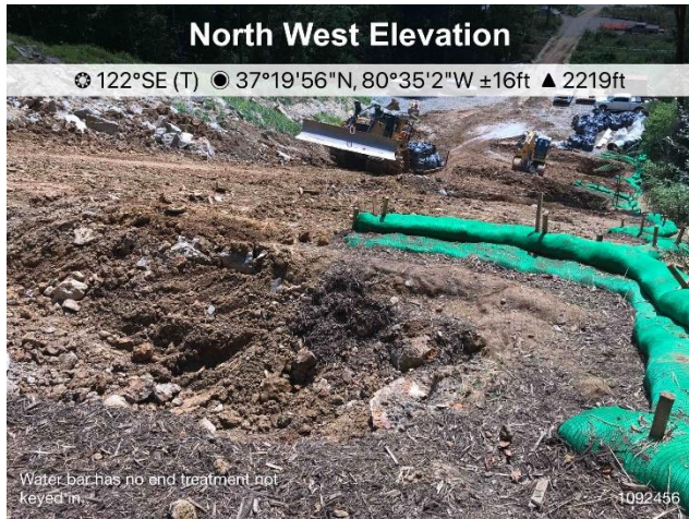
▪ Figure 5: St 10924{+56 water bar end treatment not keyed in