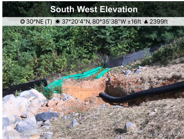
Figure 1: St 10891+97 sump requires maintenance