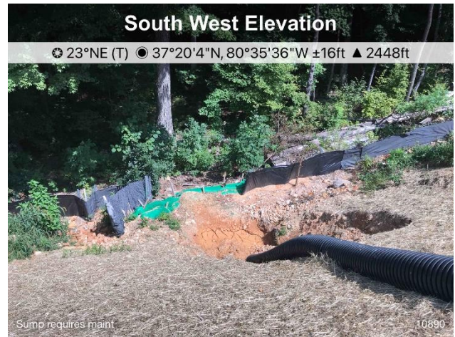
Figure 2: St 10890 sump requires maintenance