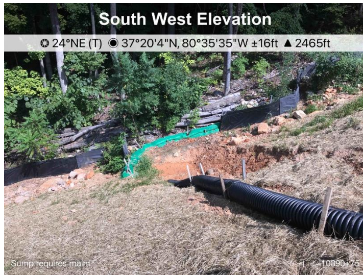
Figure 3: St 10890+75 sump requires maintenance