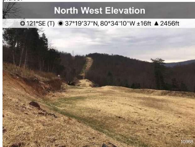
Figure 3: St10968 area has been stabilized and ECD's are in place.