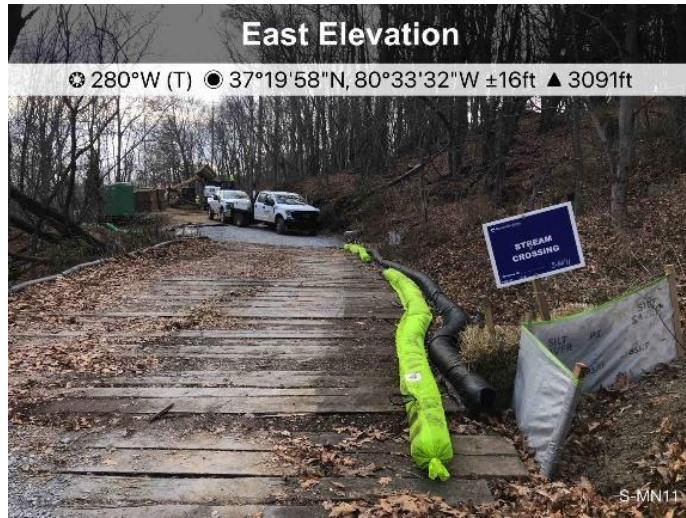
Figure 1. Designated crossing S-MN11, ECD's are in place.