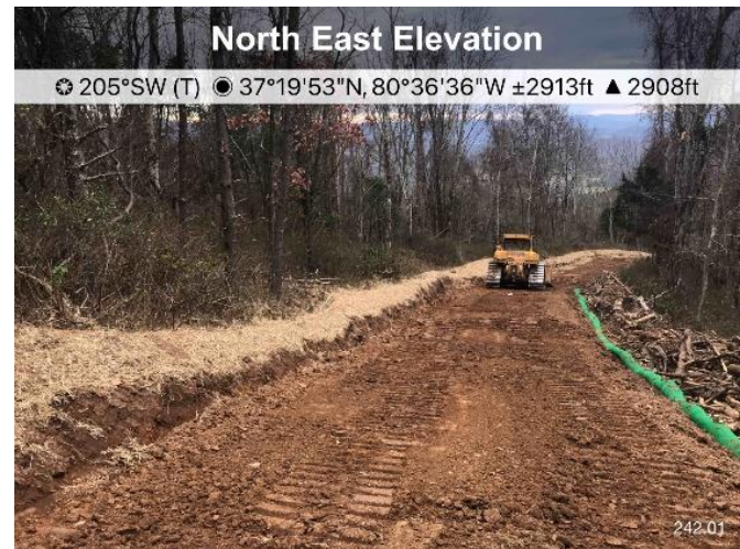
Figure 2: Construction of AR GI 242.01, ECD's have been installed.