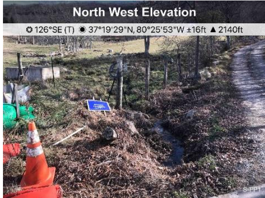
Figure 1. Designated crossing S-PP1, ECD's are in place.