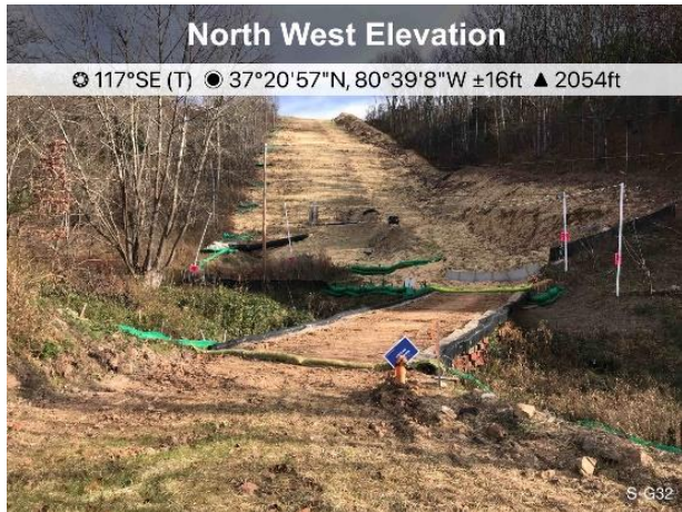
Figure 3. Designated crossing S-G32, ECD's are in place.