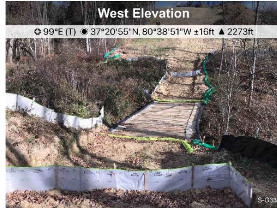
Figure 2. Designated crossing S-G33, ECD's are in place.