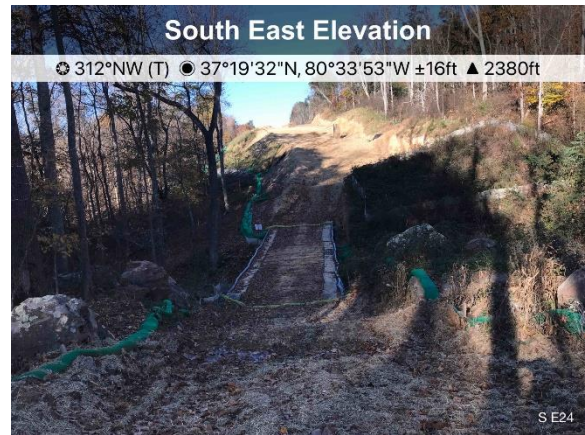
Figure 2: Designated crossing S-E24, ECD's are in place.