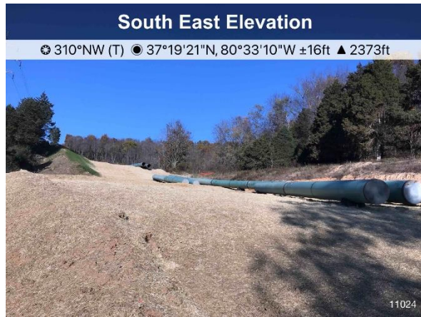
Figure 1: St11024 area is stabilized and ECD's are in place.