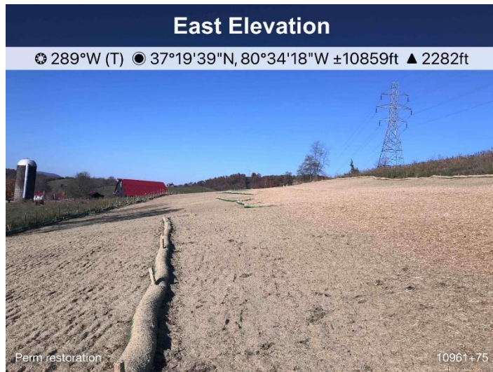
Figure 3: St10961+75 permanent restoration has been applied.