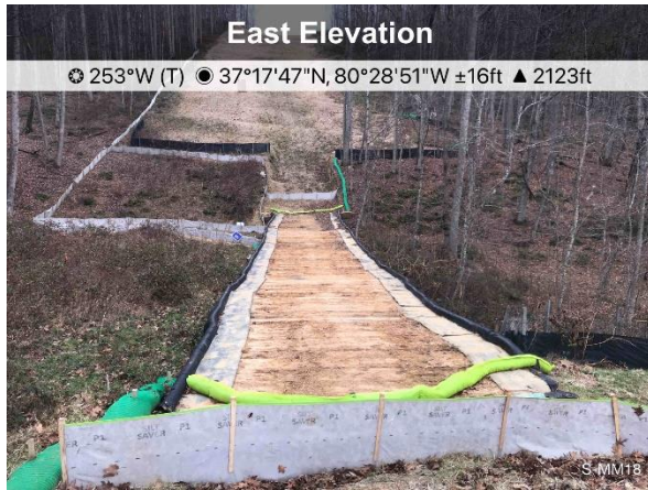
Figure 1. Designated crossing S-MM18, ECD's are in place.