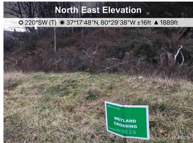
Figure 2. Designated crossing W-RR1B, ECD's are in place.