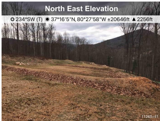
Figure 3. St11265+41 area is stabilized and ECD's are in place.