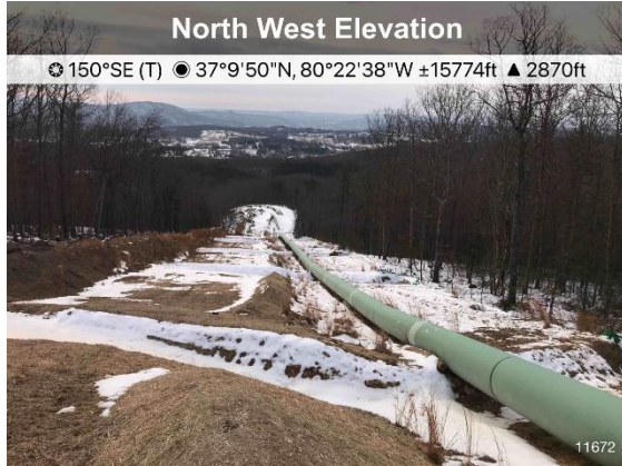
Figure 1: ESC controls were snow covered near St 11672