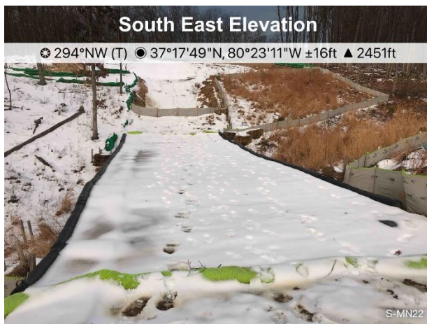
Figure 3: Designated stream crossing S-MN22, ESC controls were in place.