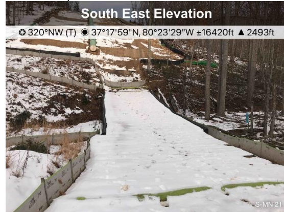
Figure 2: Designated stream crossing S-MN21, ESC controls were in place.