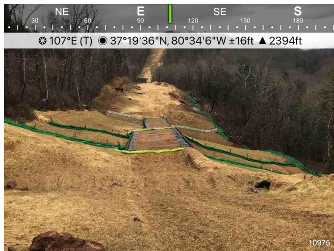
Figure 3: St10975, ECD's are in place and functioning.