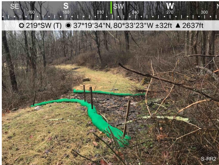
Figure 1: Designated crossing S-RR2, ESC's are in place and functioning.