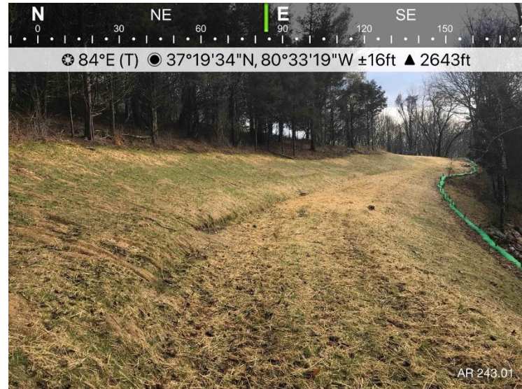
Figure 2: ESC controls were in place on AR 243.01