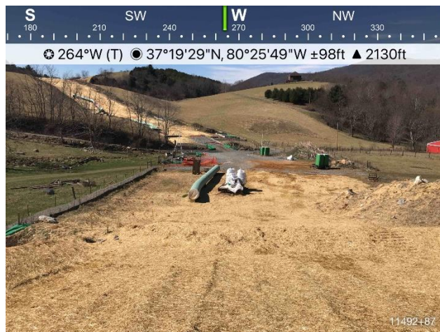
Figure 3: St 11492+87, ECD's are in place and functioning.