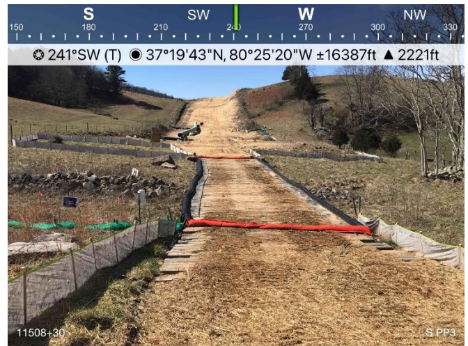
Figure 2: Designated crossing S-PP3, ESC's are in place and functioning.