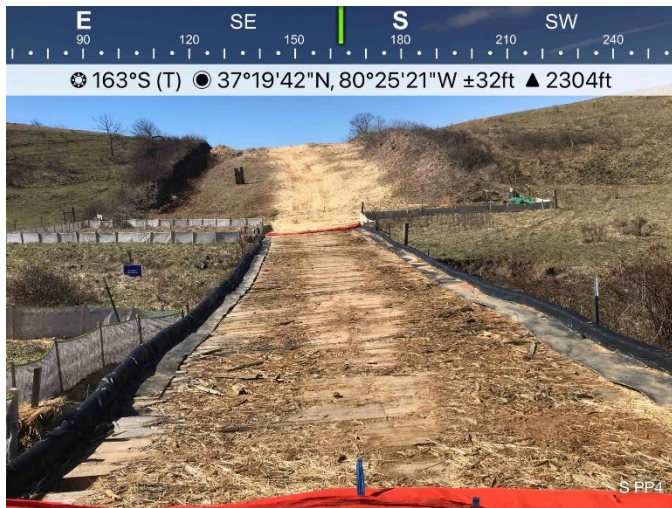
Figure 1: Designated crossing S-PP4, ESC's are in place and functioning.