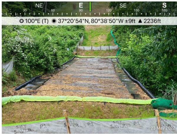
Figure 3: Designated crossing S-G33, ESC's are in place and functioning.