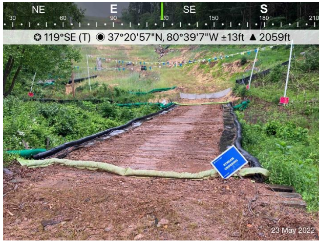
Figure 1: Designated crossing S-G32, ESC's are in place and functioning.