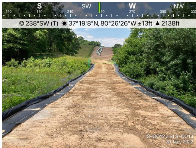
Figure 1: Designated crossing S-0013&S-0013, ESC's are in place and functioning.