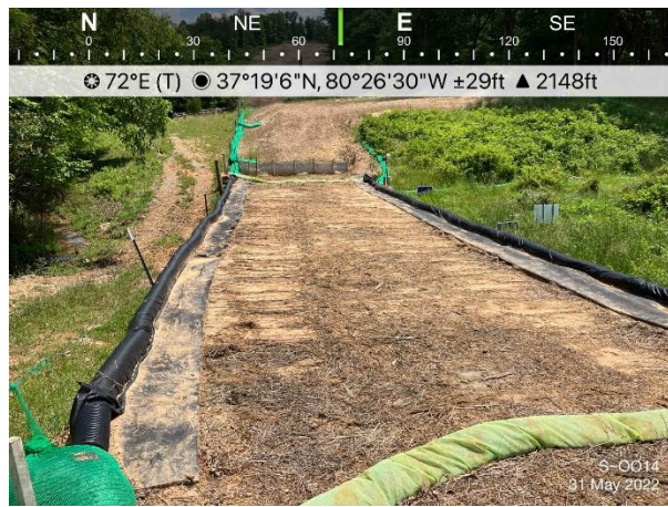
Figure 3: Designated crossing S-0014, ESC's are in place and functioning.