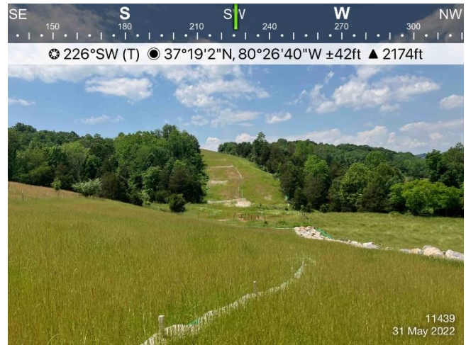
Figure 2: St11439 ECD's and stabilization in place.