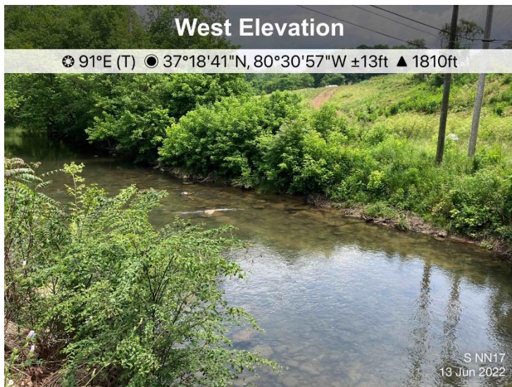
Figure 3: Designated crossing S-NN17, ESC's are in place and functioning.