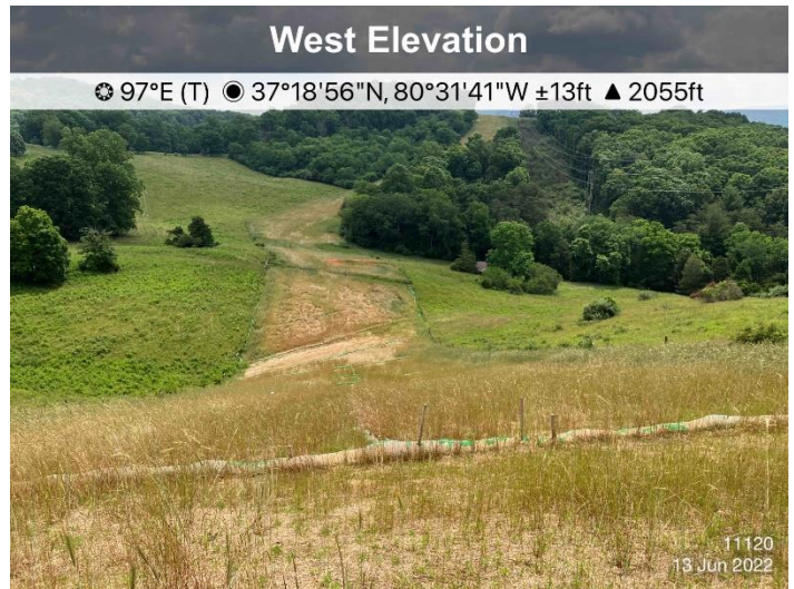
Figure 2: St11120, ECD's and stabilization in place.