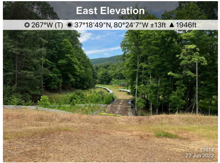
Figure 2: St11614, ECD's and stabilization in place.