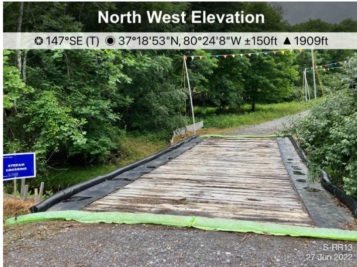
Figure 1: Designated crossing S-RR13, ESC's are in place and functioning.