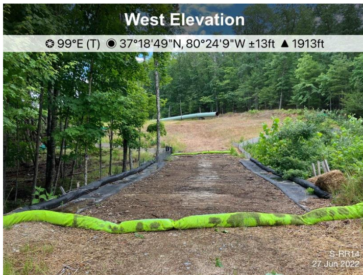
Figure 3: Designated crossing S-RR14, ESC's are in place and functioning.