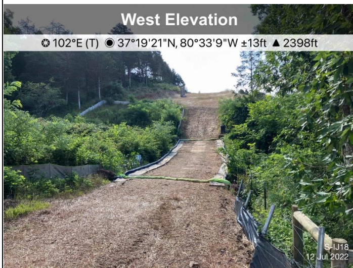
Figure 3: Designated crossing S-IJ18, ECD's are in place.