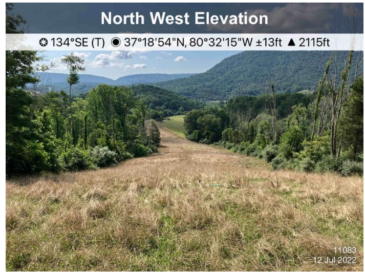
Figure 2: St11083, ECD's and stabilization are in place