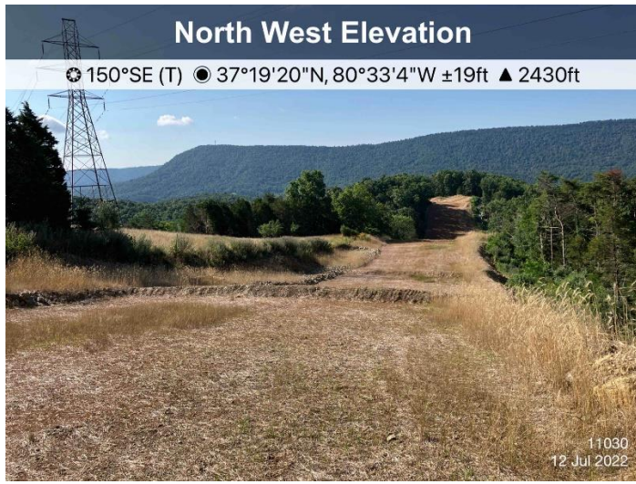
Figure 1: St11030, ECD's and stabilization are in place.