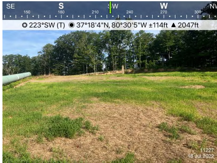
Figure 1: STA 11227+00 – Controls in place and functioning properly.