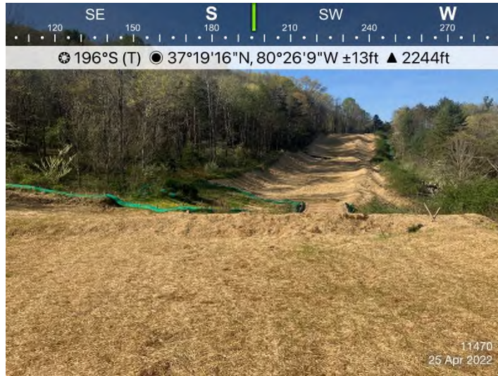
Figure 1: STA 11470+00 – Controls in place and functioning properly.