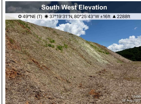
Figure 2: St11498, ECD's and stabilization are in place.