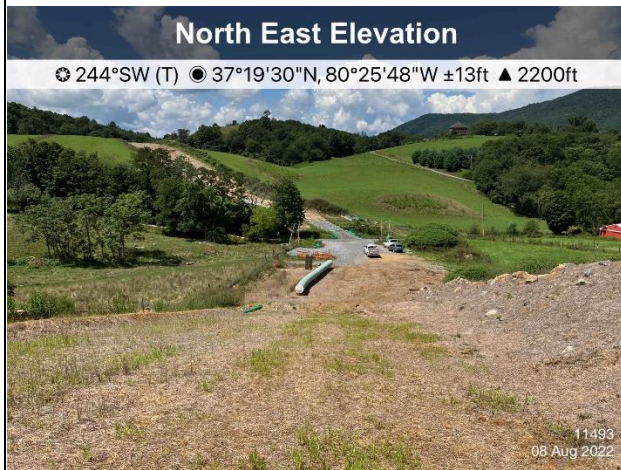
Figure 3: St11493, ECD's and stabilization are in place.