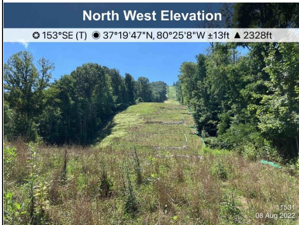
Figure 1: St11531 ECD's and stabilization are in place.