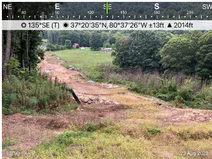
Figure 3: St10790, ECD's and stabilization are in place.