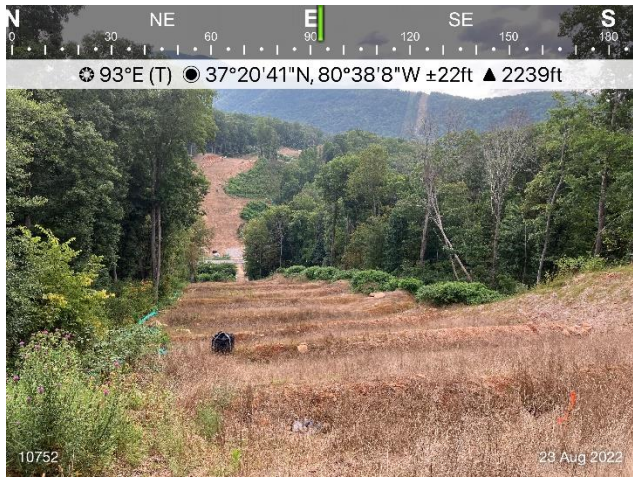
Figure 1: St10752, ECD's and stabilization are in place.