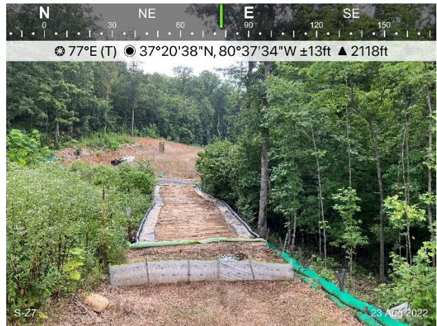
Figure 2: Designated crossing S-Z7, ECD's are in place.