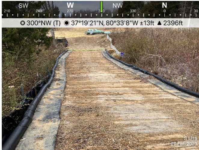
Figure 1: Designated crossing S-IJ18, ECD's are in place.