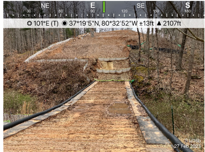
Figure 2: Designated crossing S-IJ16b, ECD's are in place.