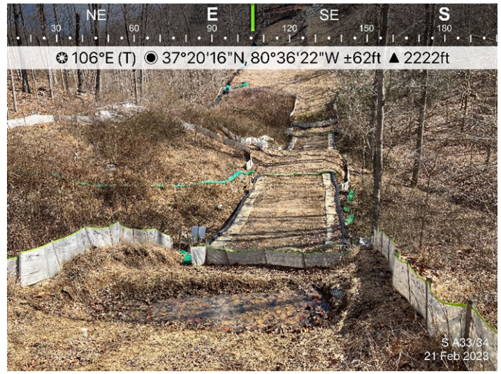
Figure 2: Designated crossing S-A33&34, ECD's are in place.