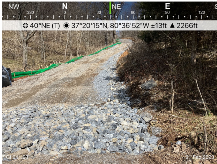
Figure 1: AR-GI 241.03 ECD's are in place.