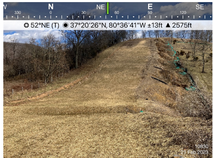
Figure 3: St10830 ECD's are in place.