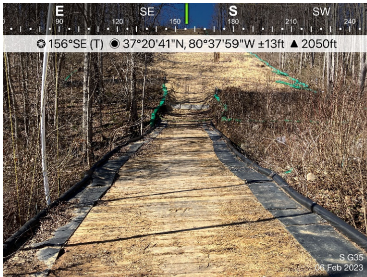
Figure 3: Designated crossing S-G35, ECD's are in place.