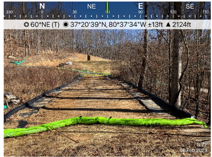
Figure 2: Designated crossing S-Z7, ECD's are in place.