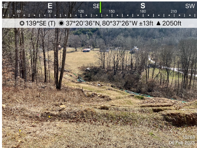
Figure 1: St 10788, area is stabilized and ECD's are in place.