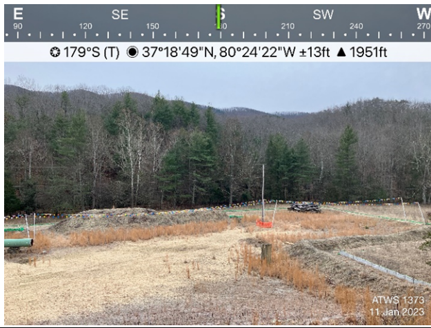
Figure 1: ATWS 1373, area is stabilized and ECD's are in place.