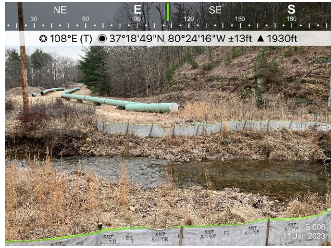
Figure 2: Designated crossing S-006, ECD's are in place.