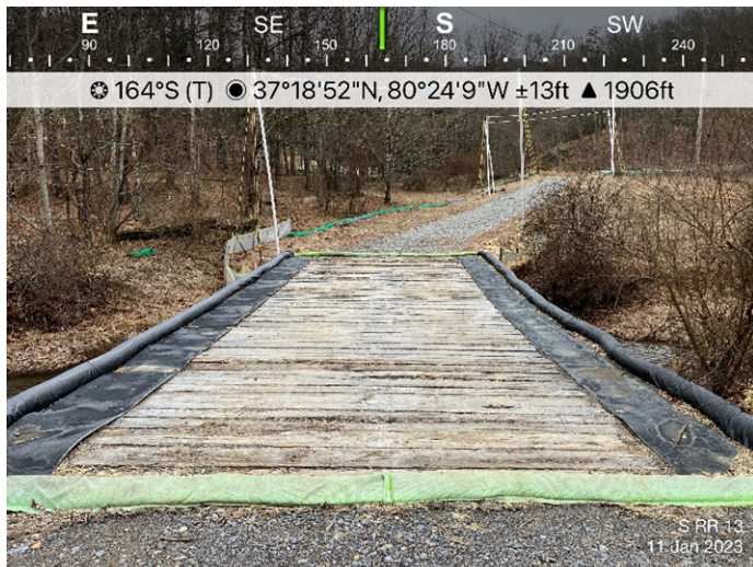
Figure 3: Designated crossing S-RR13, ECD's are in place.