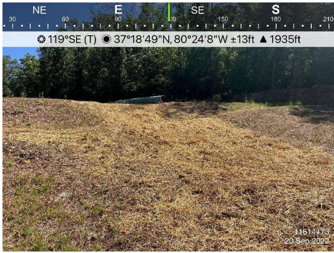
Figure 1: St11614+73, ECD's and stabilization are in place.