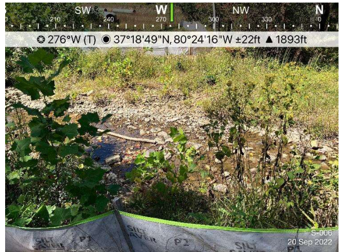
Figure 2: Designated crossing S-006, ECD's are in place.