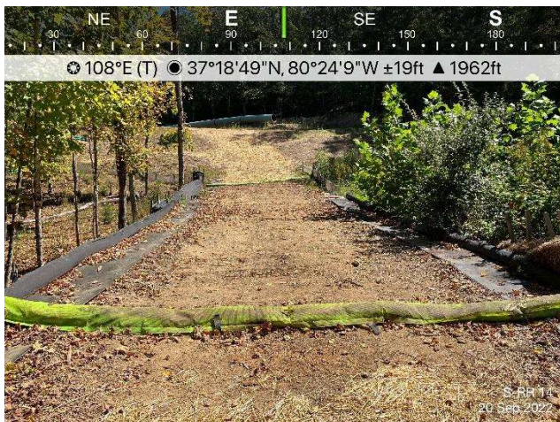
Figure 3: Designated crossing S-RR14, ECD's are in place.