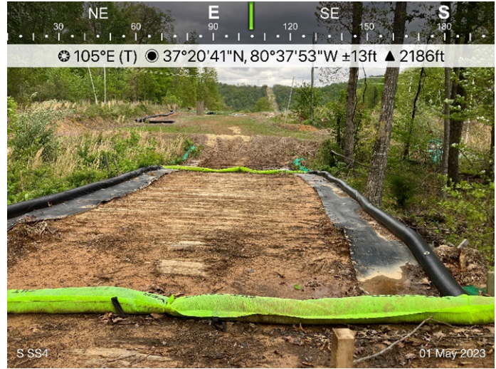
Figure 2: Designated crossing, S-SS4, ECD's are in place.