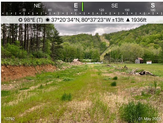
Figure 3: Sta 10792, ECD's and stabilization remains in place.