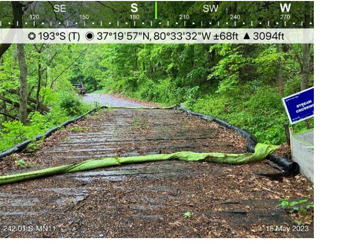
Figure 3: AR GI 242.01 designated crossing S-MN11, ESC measures in place.