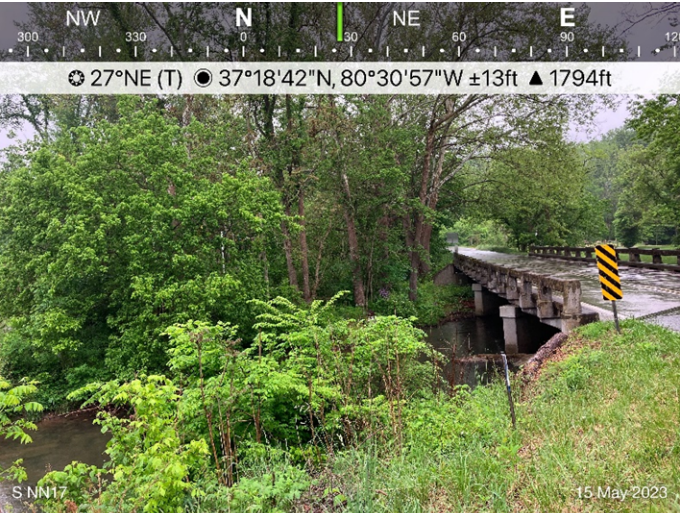
Figure 1: Designated crossing S-NN17, remains undisturbed and ESC measure are in place.