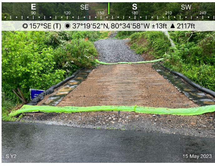
Figure 2: Designated crossing S-Y2, ESC measures in place.