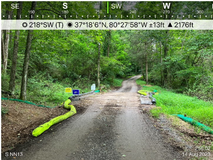
Figure 3: Designated Crossing S-, ECD's are in place for active construction.