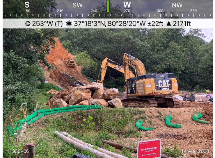
Figure 2: Sta 13330+06, ECD's are in place.