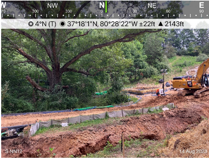
Figure 1: Designated crossing S-NN12, ECD's are in place.