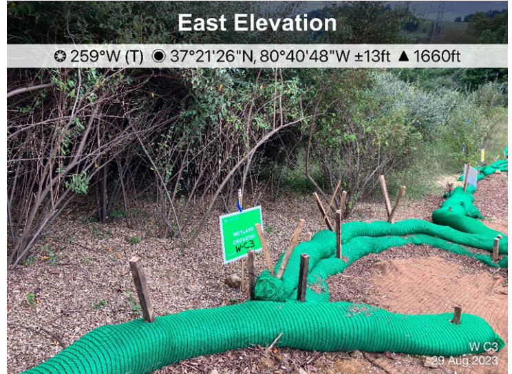
Figure 2: Designated crossing W-C3, ECD's are in place.