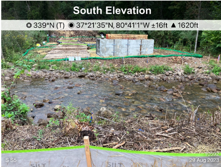
Figure 1: Designated crossing S-S5, ECD's are in place.