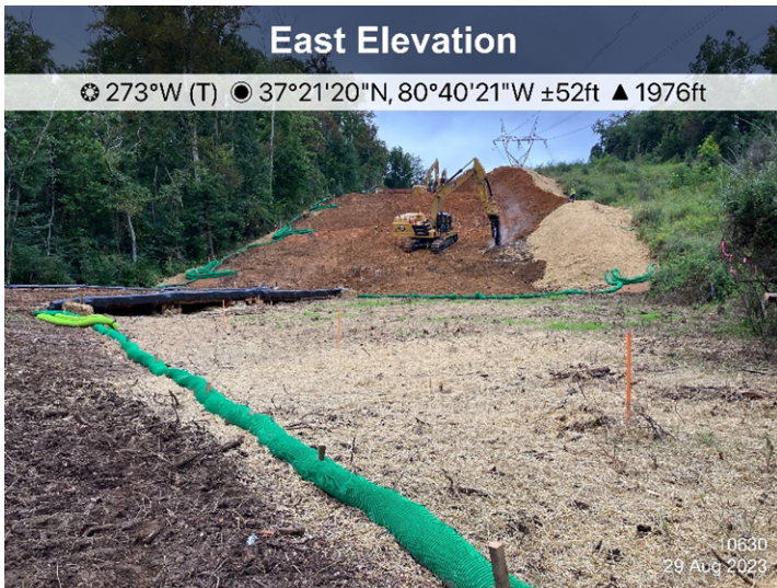
Figure 3: STA 10630, ECD's are in place.