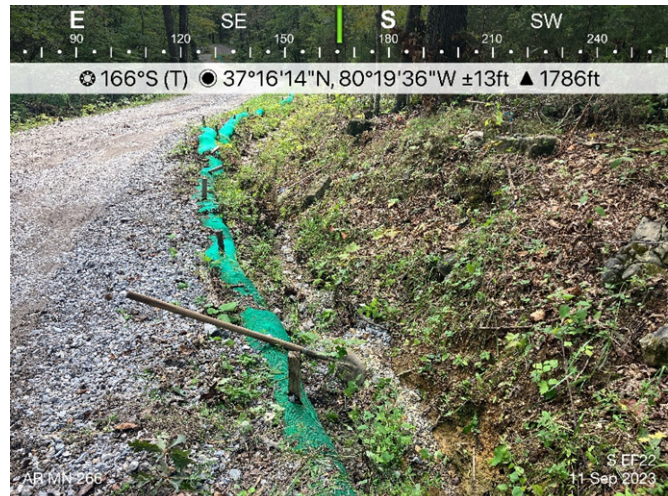
Figure 2: Designated stream S-EF22 along was impacted with gravel.