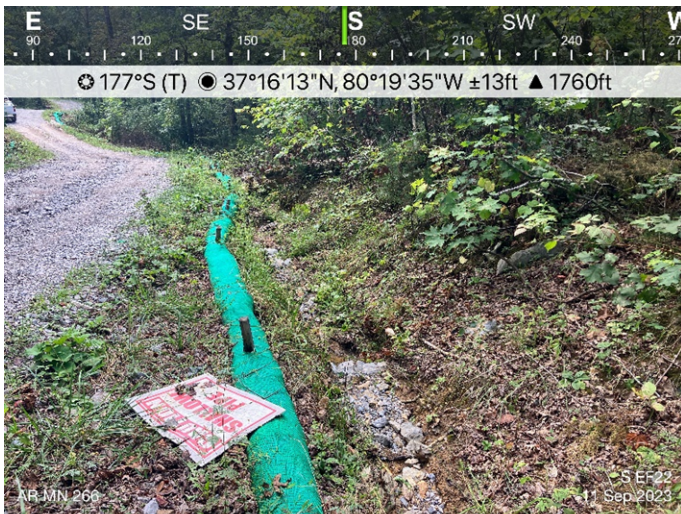
Figure 3: Designated stream S-EF22 along was impacted with gravel.