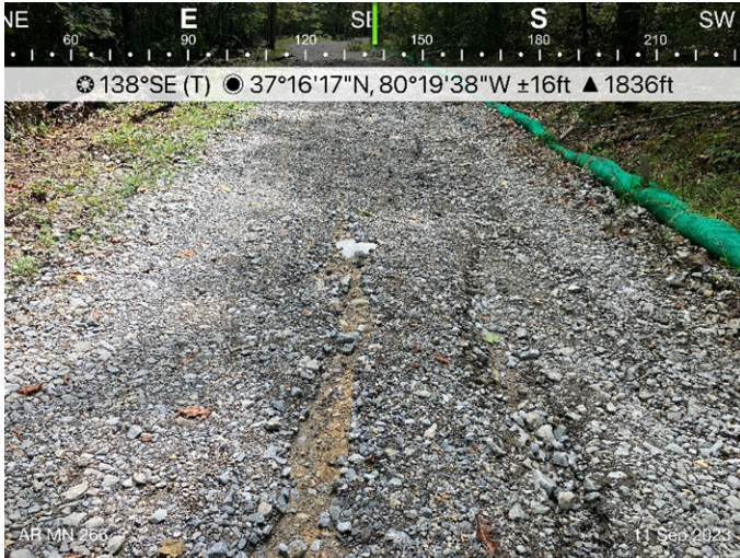
Figure 1: Rill erosion along access road MN 266.