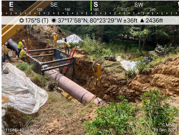
Figure 1: Designated crossing S-MN21, active lowering & welding.