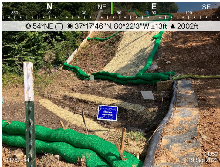
Figure 3: Designated crossing S-IJ52, ECD's are in place.