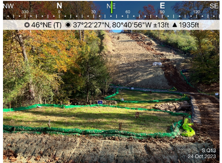
Figure 2: Designated crossing S-Q13, ECD's are in place.