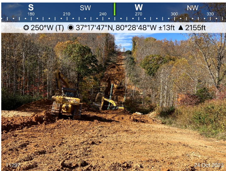
Figure 3: Sta11297, ECD's are in place.