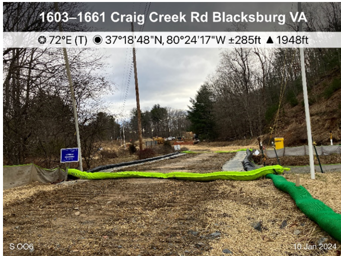
Figure 1: Designated crossing S-006, ECD's are in place.