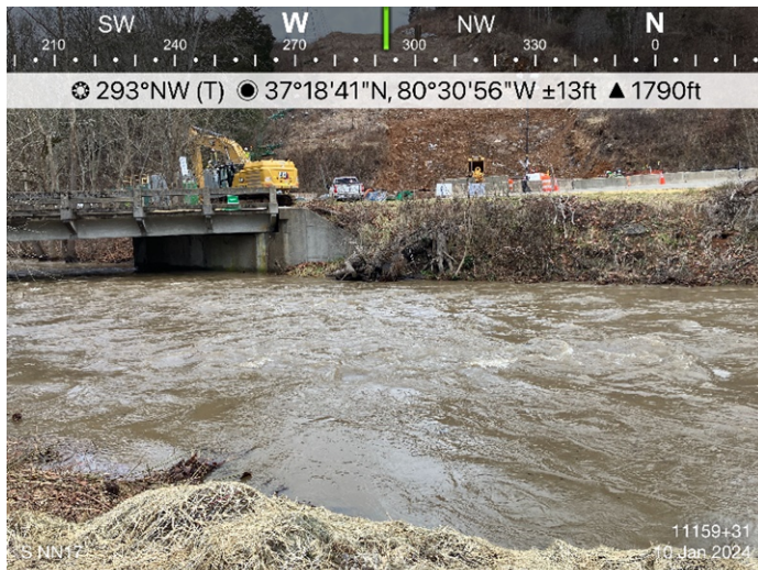
Figure 3: Designated crossing S-NN17, ECD's were being maintained.