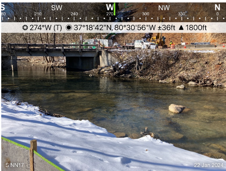
Figure 3: Designated crossing S-NN17, ECD's are in place.