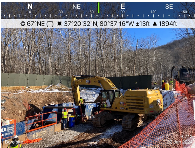
Figure 1: Designated crossing S-Z13 bore site, ECD's are in place.