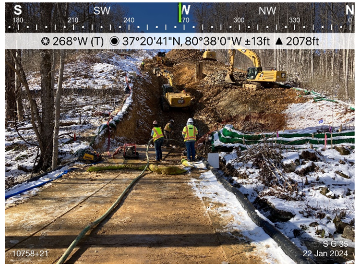
Figure 2: Designated crossing S-G35, ECD's are in place.