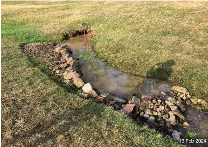
Figure 2: Rt. 42 and Clover Hollow Dr. – Spring located off ROW near intersection of Rt. 42 and Clover Hollow Dr.

☉ 264°W (T) ☉ 37.300783°N, 80.490614°W ±22ft ▲ 1862ft