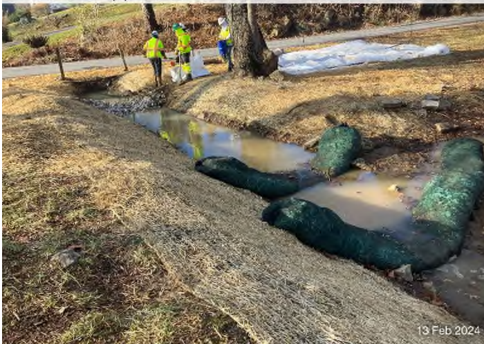
Figure 4: Rt. 42 and Clover Hollow Dr. – Confluence of Sinking Creek and spring.

☉ 318°NW (T) ☉ 37.301745°N, 80.490414°W ±36ft ▲ 1883ft