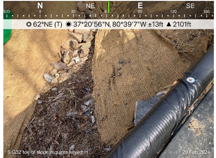
Figure 2: Designated stream S-G32, matting is not keyed in.