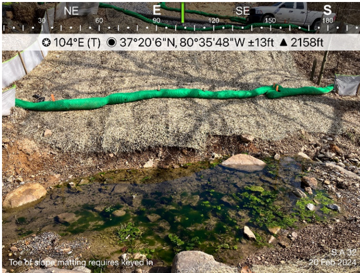
Figure 1: Designated stream S-A32, matting is not keyed in.