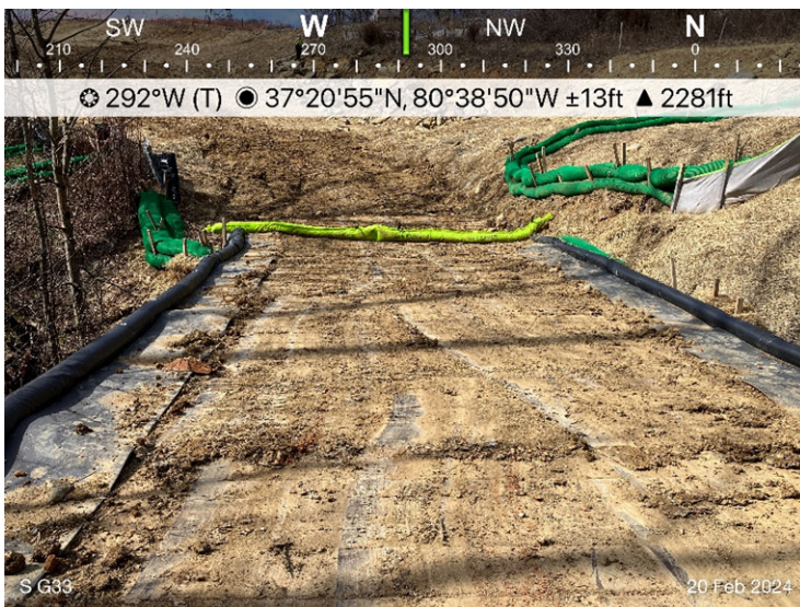
Figure 3: Designated stream S-G33, debris/ sediment is on bridge