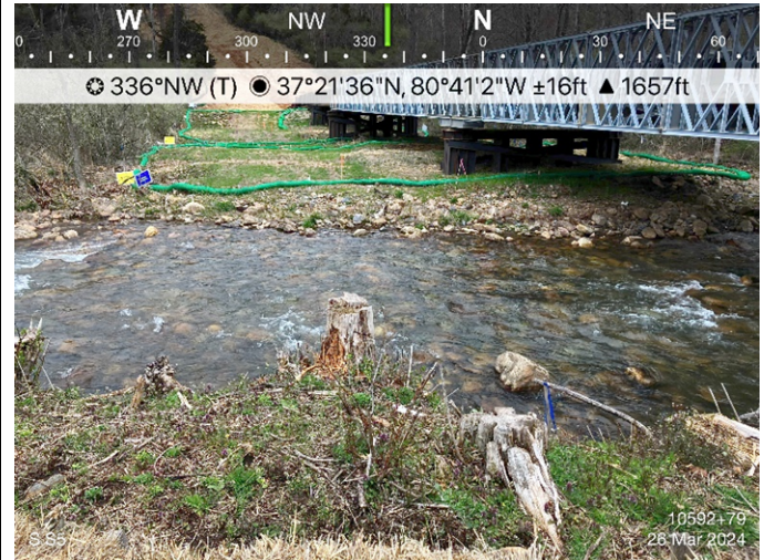
Figure 2: Designated crossing S-S5, stabilization and ESC are in place.