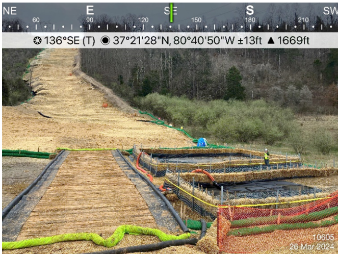
Figure 3: Sta 10605, dewatering structures in place and functioning.