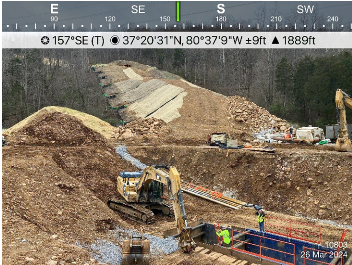
Figure 1: Sta 10803, bore site for designated stream S-Z13.