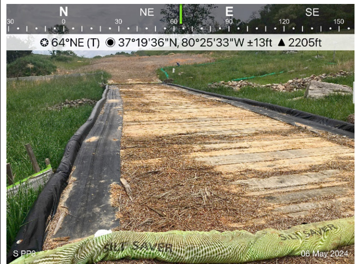
Figure 2: Designated crossing S-PP3, ESC is in place.