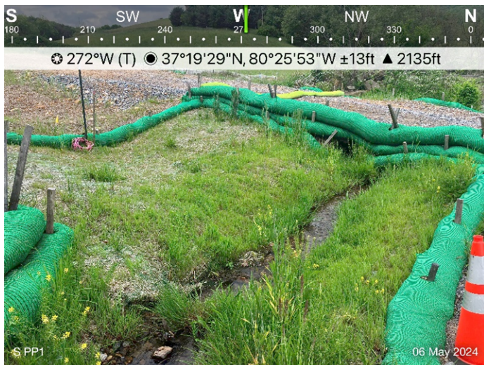
Figure 3: Designated crossing S-PP1, ESC in place.