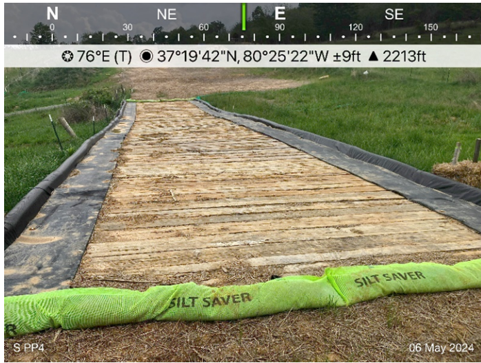
Figure 1: Designated crossing S-PP4, ESC is in place.