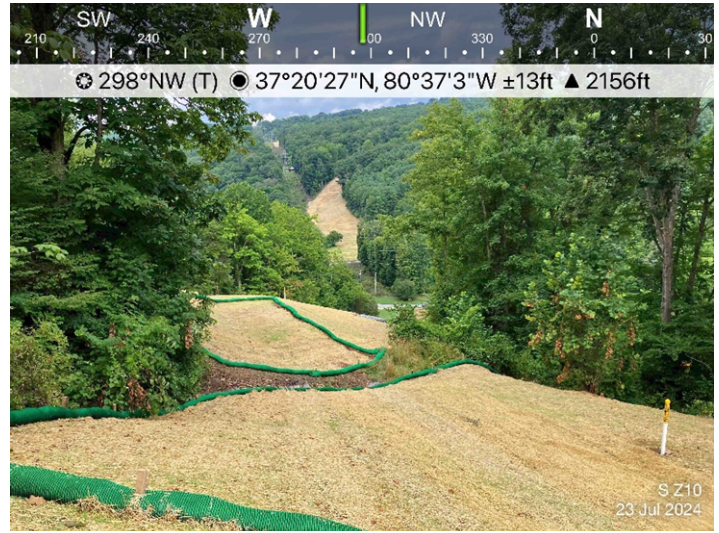
Fig. 2 Description: Designated Crossing S-Z10, ESC is in place.