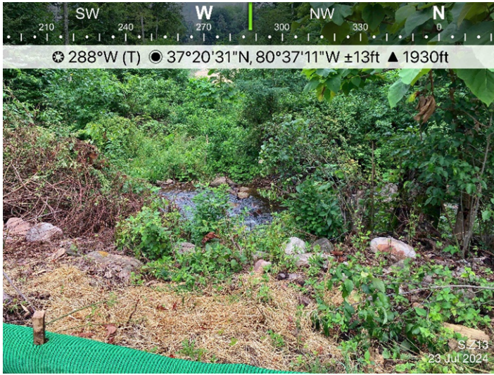
Fig. 1 Description: Designated Crossing S-Z13, ESC is in place.