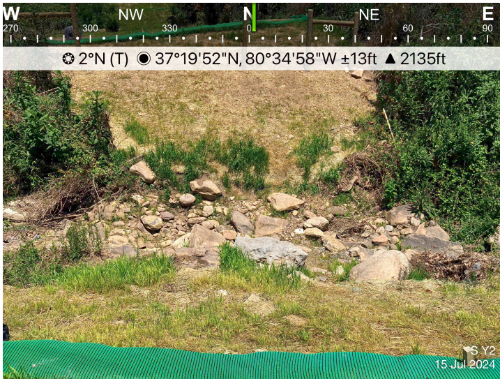
Figure 3: Designated Stream S-Y2, ESC is in place.