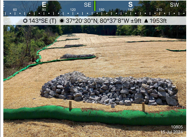
Figure 2: Sta 10805, permanent waterbars and ESC is in place.