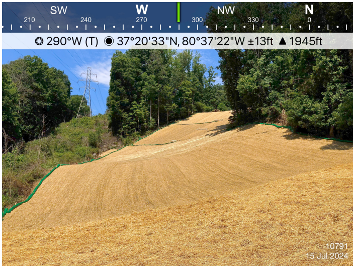
Figure 1: Sta 10791, stabilization and ESC is in place.