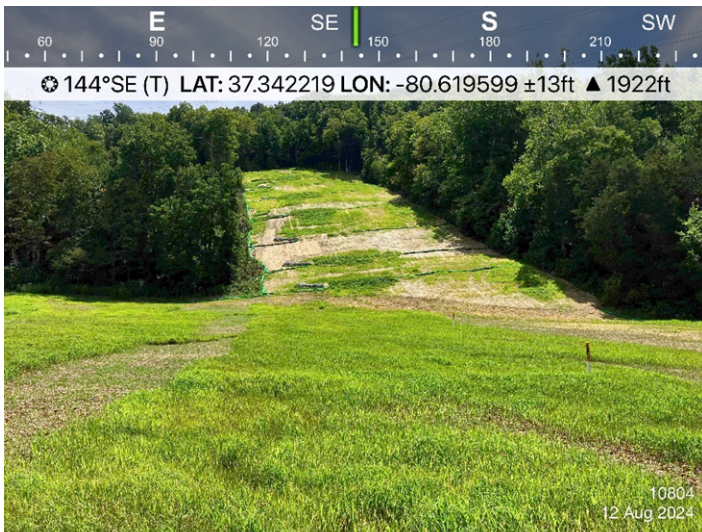
Fig. 3 Description: Sta 10804, permanent waterbars and ESC is in place.