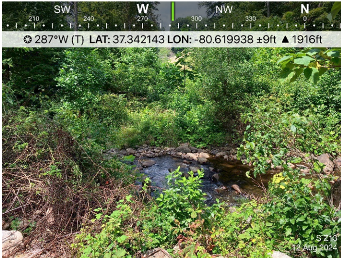
Fig. 1 Description: Designated Crossing S-Z13, ESC is in place.