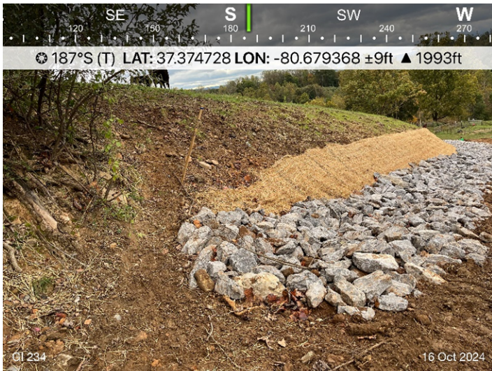
Fig. 1 Description: Cattle crossing area, ESC is in place.