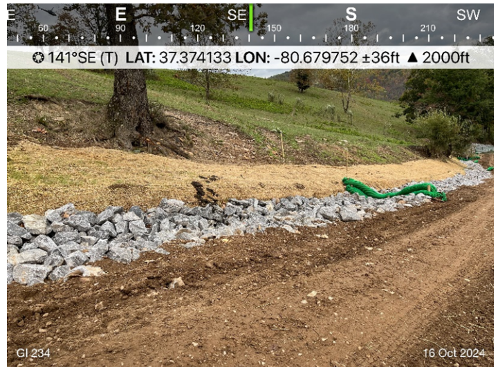
Fig. 2 Description: Past cattle trail/ crossing location, ESC is in place.