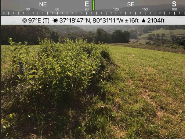
Figure 1: ATWS 1366 & 1367 dormant and stabilized.