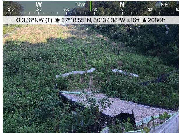
Figure 2: Near MP 209.4 ECD's are in place and functioning.