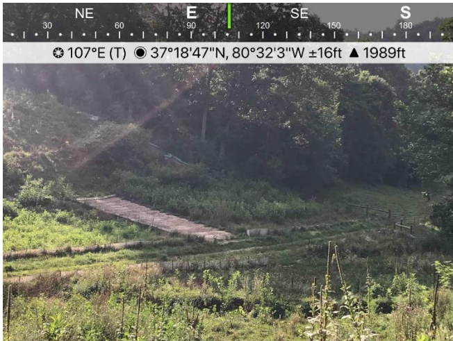
Figure 3: Near MP 210 and ATWS 1366