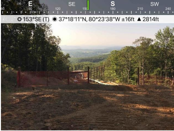
Figure 1: Gate installed near St11670+00