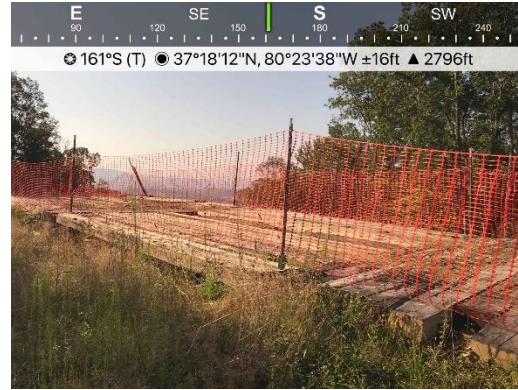
Figure 2: Wash station protected near St11670+00