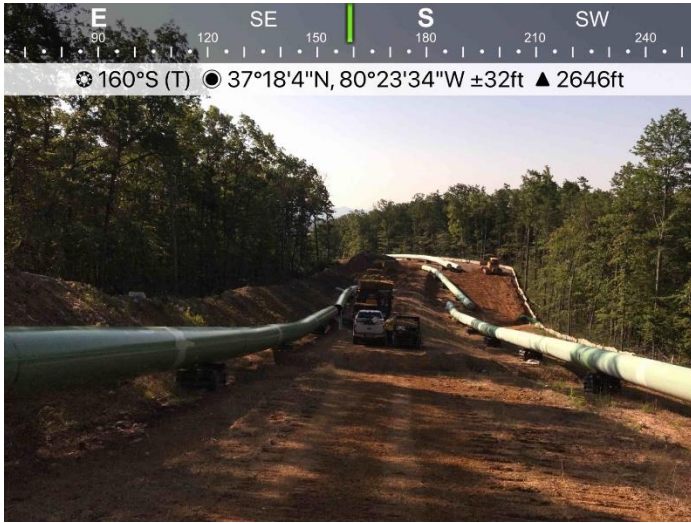
Figure 3: Near MP 221 straw stockpile and stabilization work was being conducted.