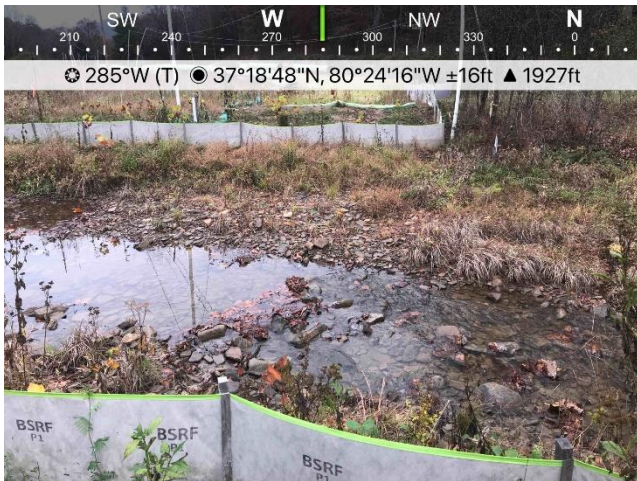
Figure 3: Designated stream crossing S-006, ECD's are in place.