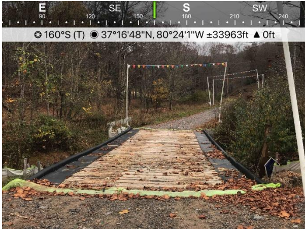
Figure 1: Designated stream crossing S-RR13, ECD's are in place.