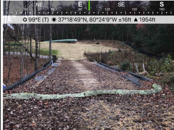
Figure 2: Designated stream crossing S-RR14, ECD's are in place.