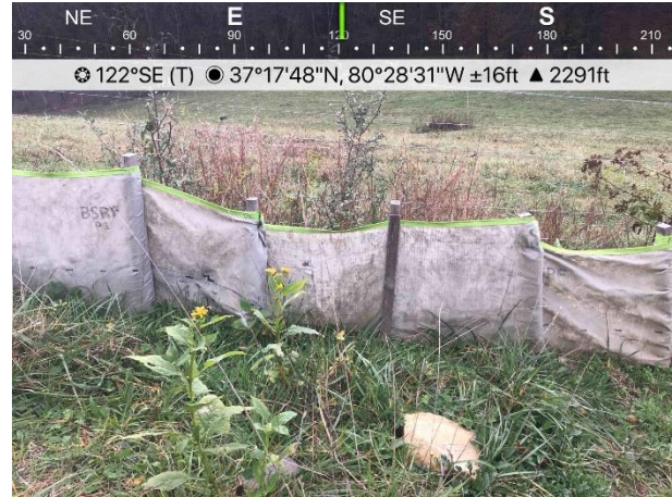
Figure 2: Silt fence maintenance required at St11310+70