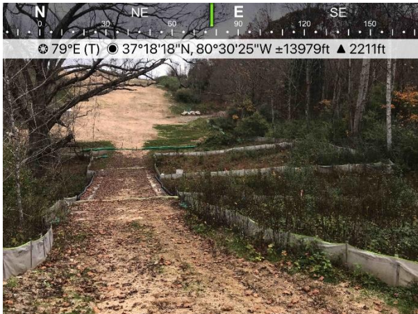
Figure 3: Designated stream crossing S-NN12, ECD's are in place.