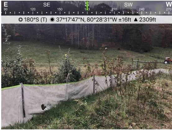
Figure 1: Silt fence maintenance required at St11310+30