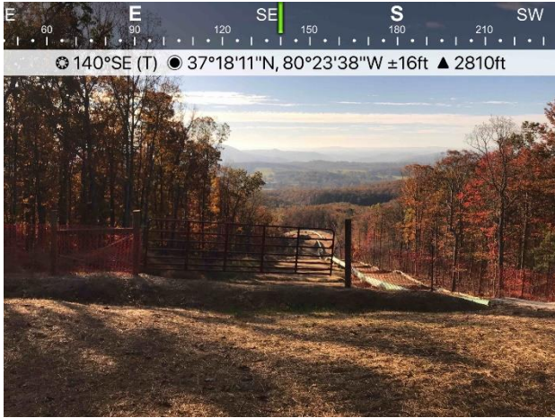
Figure 1: Near St 11670 area remains stabilized and ESC controls in place.