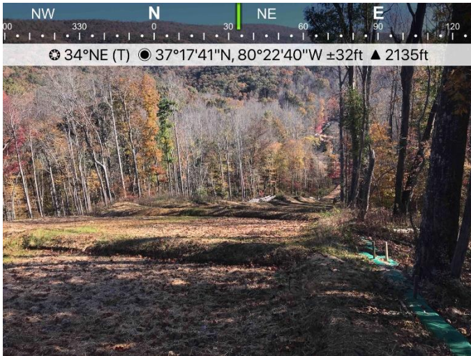
Figure 3: Near St 11774 area remains stabilized and ESC controls in place.