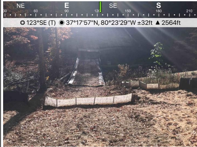
Figure 2: Designated crossing S—MM21, area is stabilized and ESC's are in place.