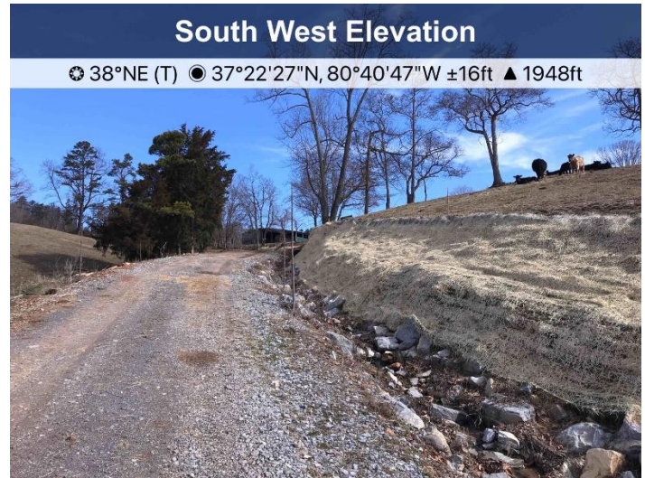
Figure 2: Blanket matted remains installed at AR GI- 234