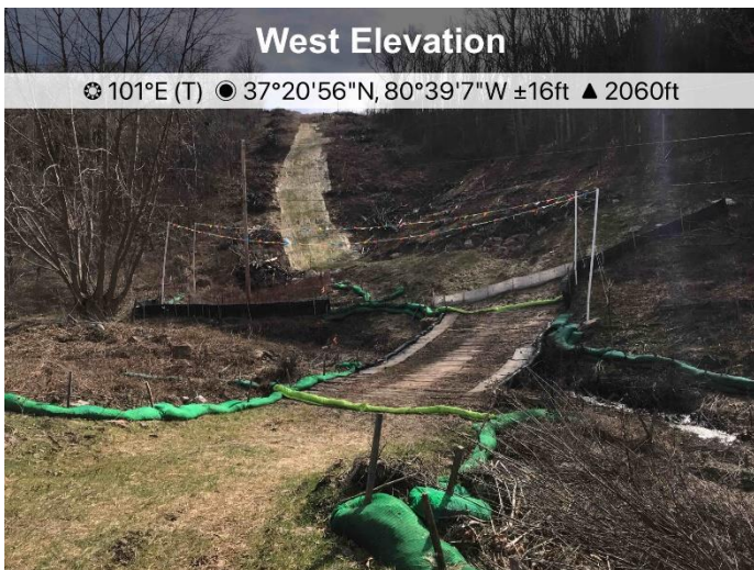
Figure 3: Designated crossing S-G32, ECD's are in place and functioning.