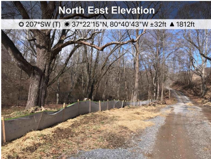
Figure 1: ECD's remain installed on AR-GI 234