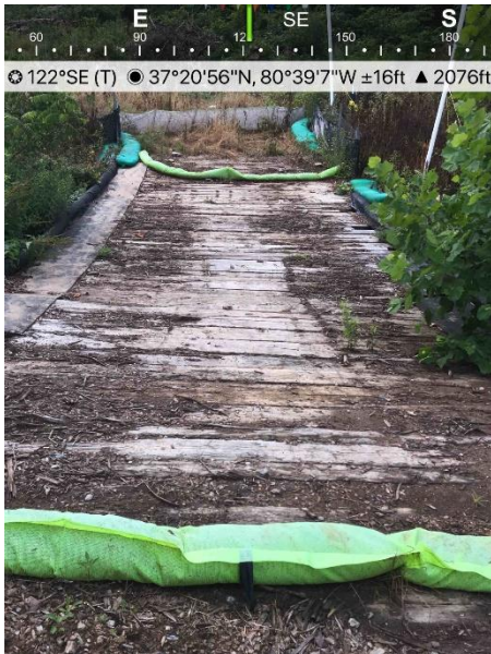
Figure 3: Designated crossing S-G32, ECDs are in place and functioning.