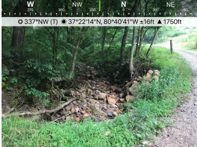
Figure 1: Designated stream S-Q14 along GI 234.