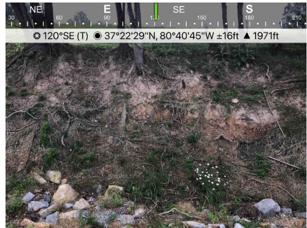
Figure 2: On access rd. GI-234, the ditch line blanket matting requires repair.