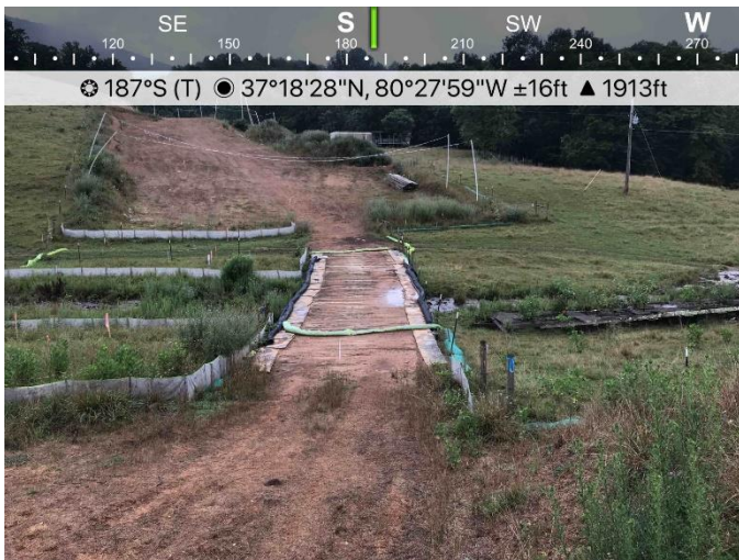
Figure 3: Designated crossing S-KL43, ECD's in place and effective.