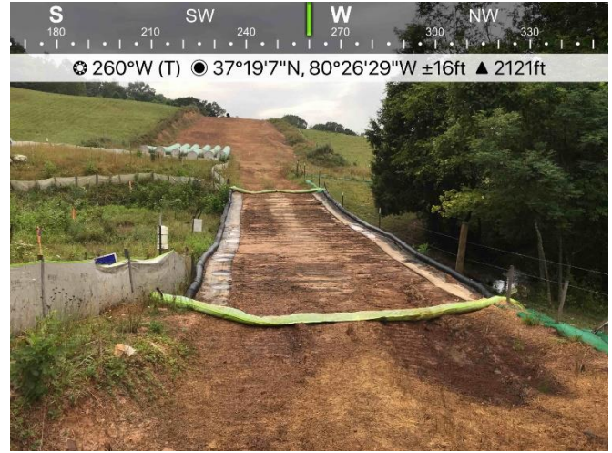
Figure 2: Designated crossing S-0014, ECD's in place and effective.