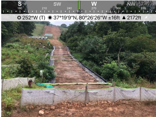
Figure 1: Designated crossing S-0013, ECD's in place and effective.