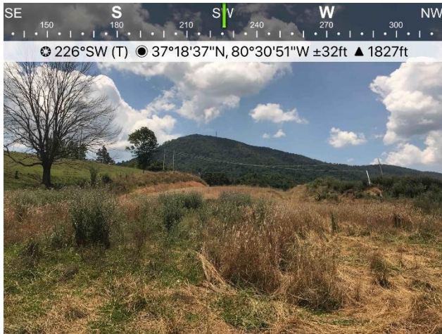
Figure 1: Near MP 211.3 area is stabilized.