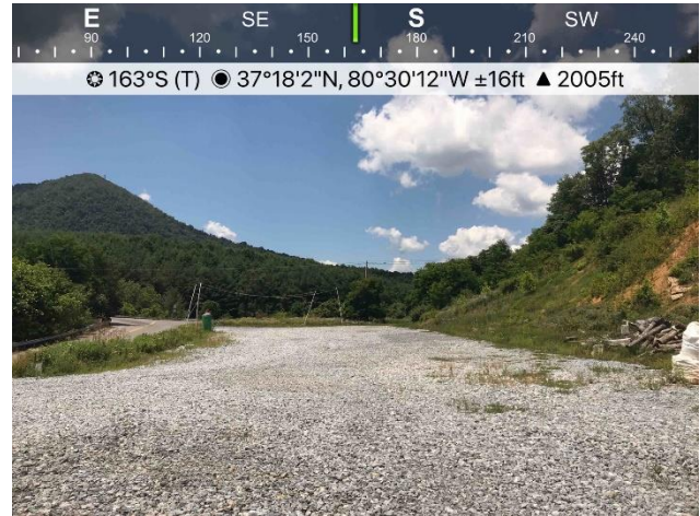
Figure 2: ATWS 1464 is dormant and currently not in use